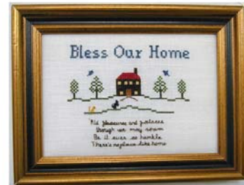
Terry's completed sampler