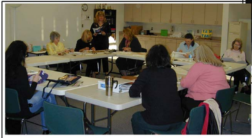
Members stitching samplers for the homes of Katrina victims